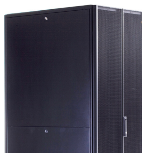
SPLIT REAR DOORS